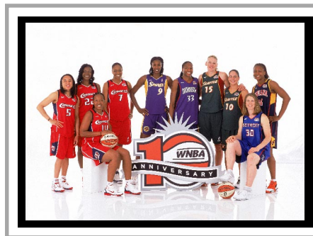
All Decade Team.