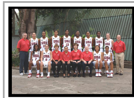
USA Basketball Team

USA Basketball began World Championship play in September of this year. The USA team won its first game with a record setting 119-72 victory over China. The team, lead by players such as Sue Bird, Diana Taurasi, Tina Thompson and Candace Parker, won their next six games. However, the dream of claiming a third straight World Championship title fell short when Russia defeated USA 75-68 in semifinal action. USA defeated Brazil to win the bronze medal 99-59.